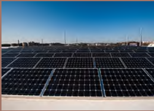
ATLANTA COMMUNITY FOODBANK

Radiance Solar Awarded close to $1 Million in Funds on Behalf of Key Community Organizations