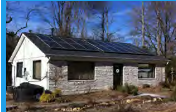
UPPER ETOWAH ALLIACE