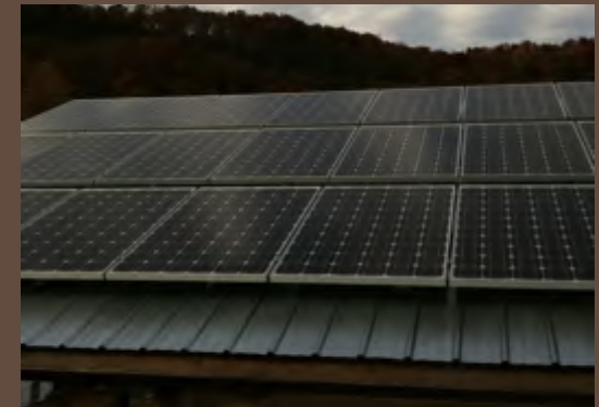
GLORY SEEDS FARMS